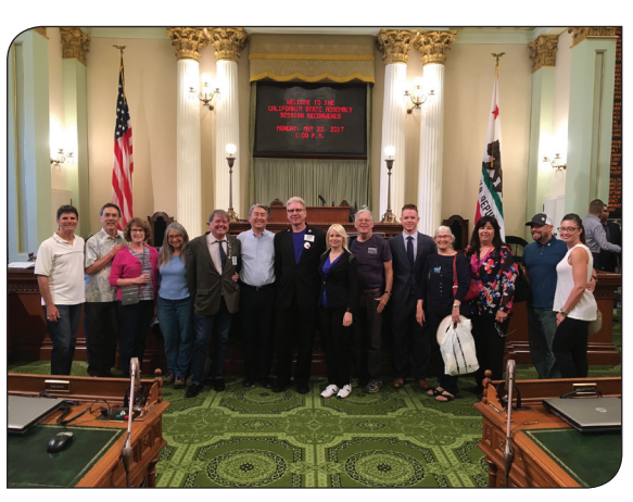
South Bay representatives visiting the State Senate chambers

Members of the 66th AD delegation and guests convened over dinner on Saturday at a local favorite called Frank Fat's. The 22